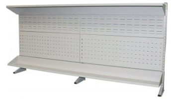
A426 Industrial Backing Panel - Bench Mount