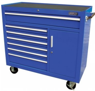
T724 Industrial Series Roller Cabinet