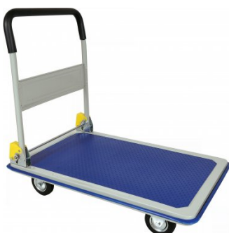
T670 Platform Trolley - 300kg Capacity