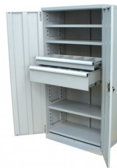
T762 Industrial Storage Cupboard