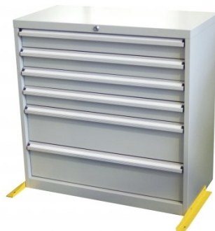
T775 Industrial Tooling Cabinet