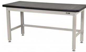
A420 Industrial Work Bench