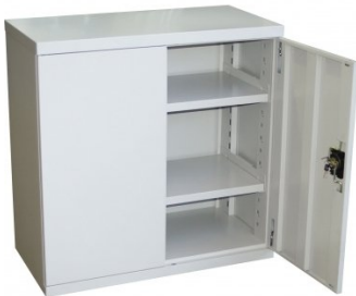
T774 Industrial Storage Cabinet