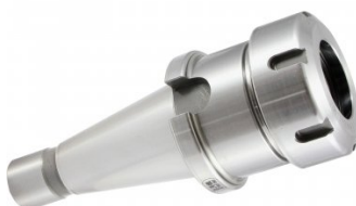
C112 Collet Chuck NT40 - ER32