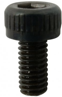
L540 Screw Seat to Suit Threading Tool Holders