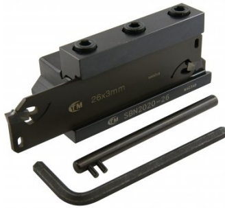
L467 Professional Lathe Parting Tool Kit - Insert Type