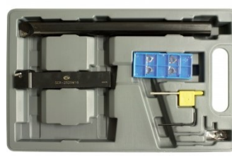
L459 Lathe Threading Tool Kit - Insert Type