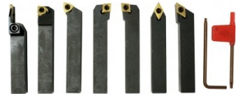
L0077 Lathe Turning Tool Kit - 7 piece Insert Type