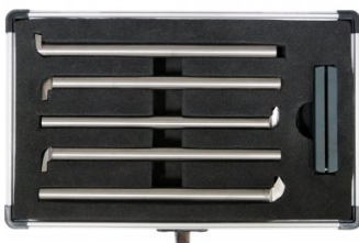
L006A Boring Bar Set - HSS