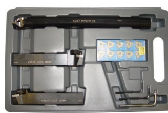
L453 Lathe Turning Tool Kit - 3 piece Insert Type