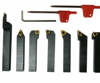
L0099 Lathe Turning Tool Kit - 7 piece Insert Type