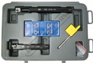
L456 Lathe Threading Tool Kit - Insert Type