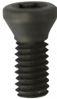
L539A Screw to Suit Threading Tool Holders