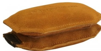
S210 Round Leather Bags - Sand Filled