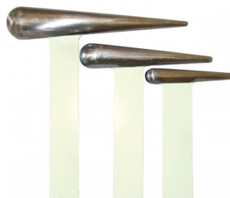
S2233 Curved Steel Dolly Set - 3 Piece