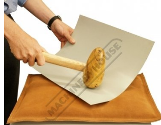
Shown With Nylon Bossing Mallet