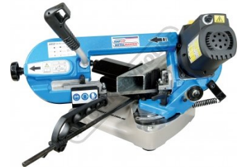
Shown with Material Front View Head Down