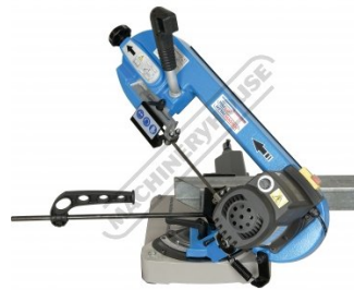
Shown with Material Right View