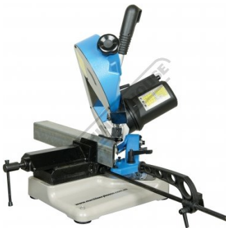
Shown with Material Left View