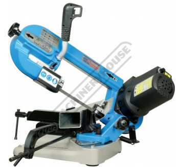
Shown with Material Low View