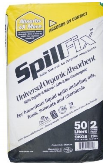
O000 SpillFix Universal Organic Absorbent