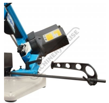
Material Length Stop