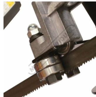
Ball Bearing Blade Guides