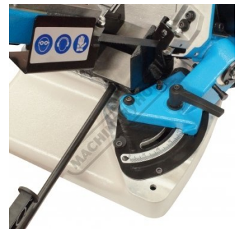
Shown at 60 degrees close up