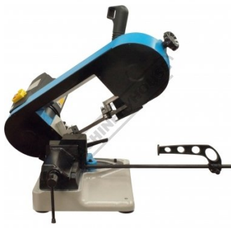
Shown at 60 degrees