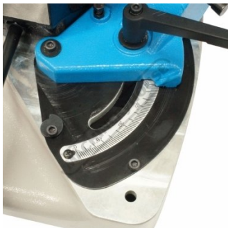
Cutting Angle Adjustment