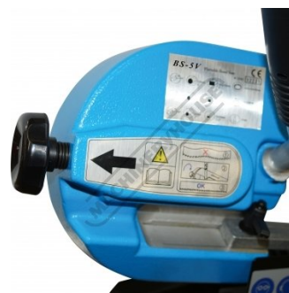
Blade Tension Adjustment