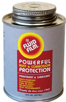
O043 Rust & Corrosion Preventive - Penetrant & Lubrication