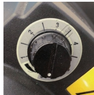
Variable Speed Dial