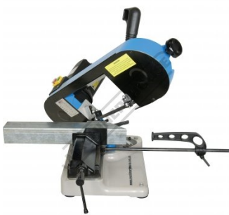
Shown with Material Side View