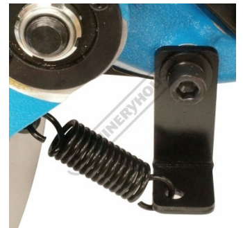
Spring Return Cutting Head