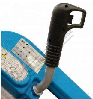
Blade Trigger On/Off Switch