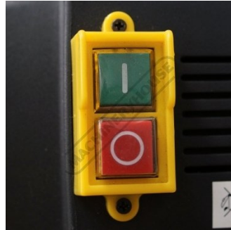
Main Power Switch