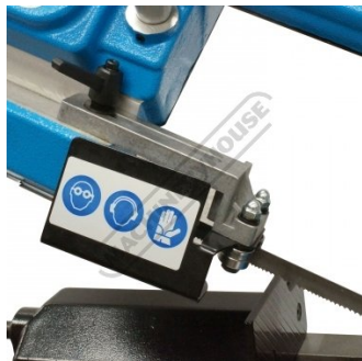
Blade Guide Adjustment