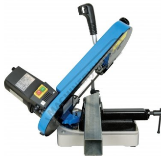
Shown with Material Rear View