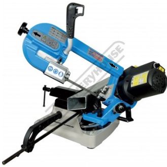
Shown with Material Cut at 45 Degrees Front View