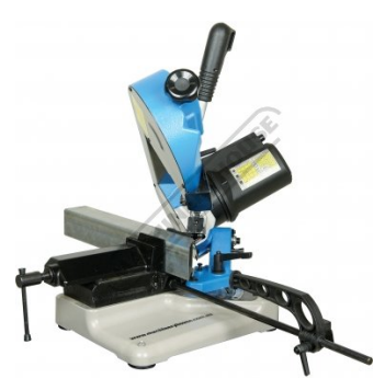
Shown with Material Left View