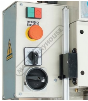
High Low With Forward and Reverse Switch