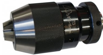
C294 Industrial Drill Chuck - Keyless Type