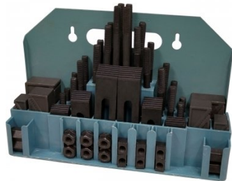
C0965 Clamp Kit 58 piece - Workshop Series