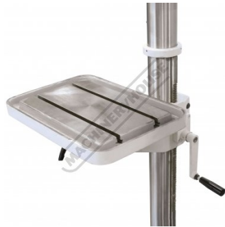
T Slotted Work Table Rotates 360 Degrees