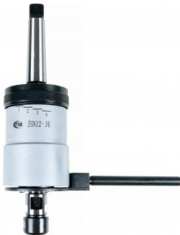
T004 Reversible Tapping Chuck - Adjustable Clutch