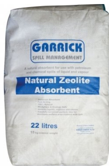
O000A Natural Zeolite Absorbent