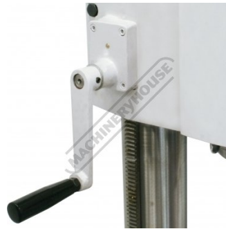
Rack and Pinion Wind Up Drill Head