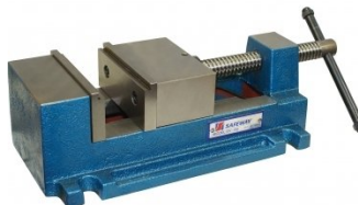
V141 Safeway Precision Drill Press Vice