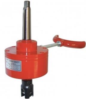
T003 Reversible Tapping Chuck