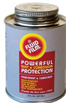
O043 Rust & Corrosion Preventive - Penetrant & Lubricant