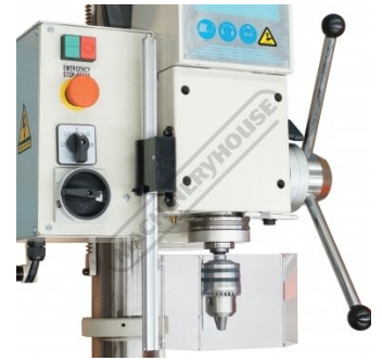
Safety Chuck Guard