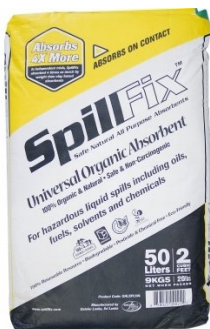
O000 SpillFix Universal Organic Absorbent