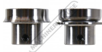
5/16" Die Set Side View