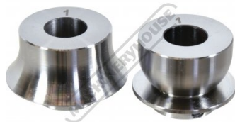
1" Die Set