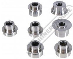
Set Rear Side