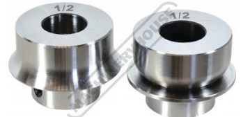
1/2" Die Set