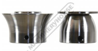
1-1/2" Die Set Side View