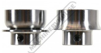
1/2" Die Set Side View