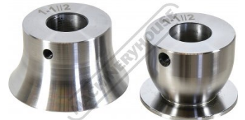
1-1/2" Die Set