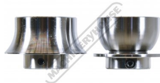
1" Die Set Side View