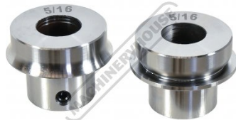
5/16" Die Set