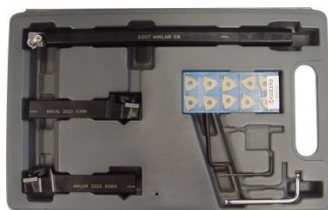
L452 Lathe Turning Tool Kit - 3 piece Insert Type