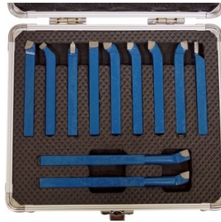
L0085 Carbide Turning Tool Set - 11 piece