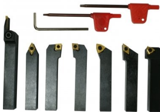
L0099 Lathe Turning Tool Kit - 7 piece Insert Type