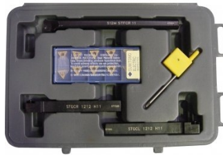
L450 Lathe Turning Tool Kit - 3 piece Insert Type