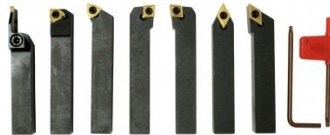
L0077 Lathe Turning Tool Kit - 7 piece Insert Type