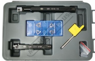
L456 Lathe Threading Tool Kit - Insert Type