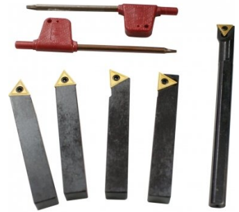
L0055 Lathe Turning Tool Kit - 5 piece Insert Type