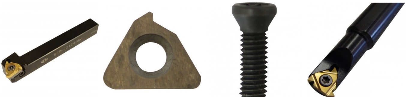
L036 Internal Threading