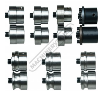
Side Profile View Of Die Sets