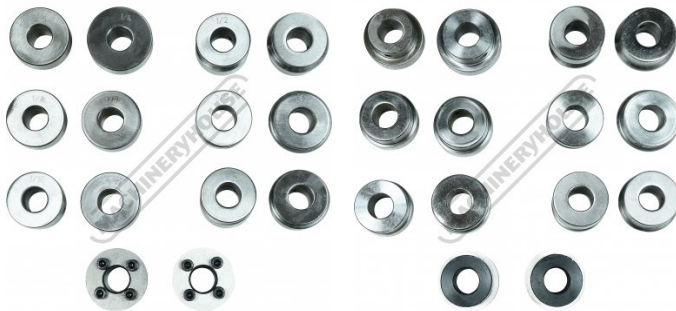
Die Sets Top View