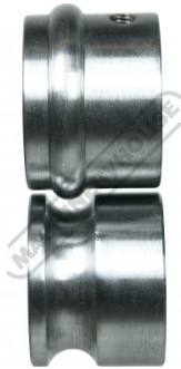
3.8 9.5mm Beading Dies