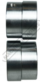
1.16 1.6mm Stepped Dies