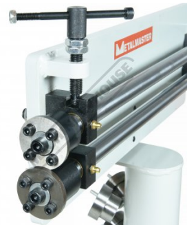
Top Roll Height Adjustment Handle