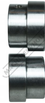
1.8 3mm Stepped Dies