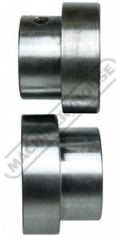
1.4 6.35mm Stepped Dies