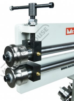
Shown With 1 2.12 Beading Dies