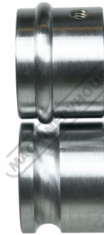
1.4 6.35mm Beading Dies