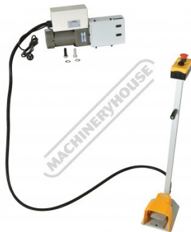
Motor Kit Assembly