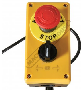
Emergency Stop-Forward-Reverse Switch