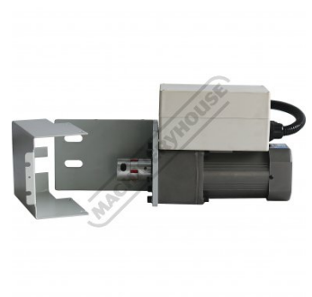
Drive Shaft Couplin Connector