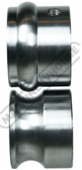
1.2 12.7mm Beading Dies