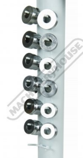
Rolls Stored on Stand