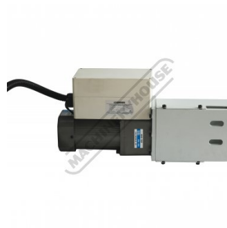
Variable Speed Drive Motor