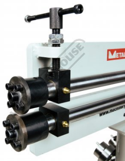
Shown With Shearing Dies