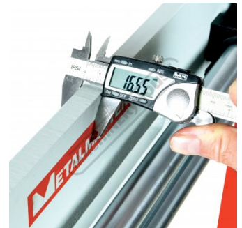
16mm Plate Steel