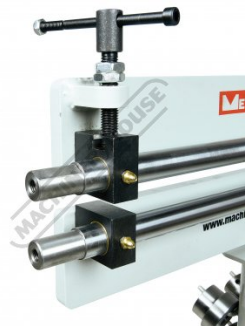
22mm Spigot for Mounting Rollers