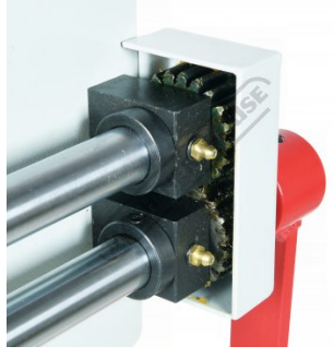
Gear Driven Rollers