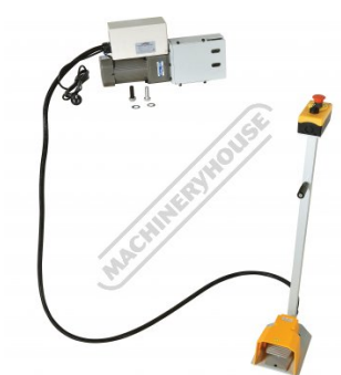
Motor Kit Assembly