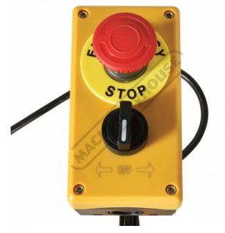
Emergency Stop-Forward-Reverse Switch