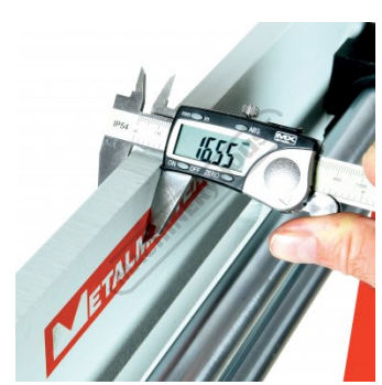
16mm Plate Steel