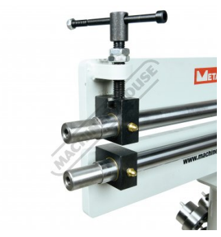
22mm Spigot for Mounting Rollers Rolls Stored on Stand