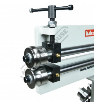
Shown With 1 2.12 Beading Dies