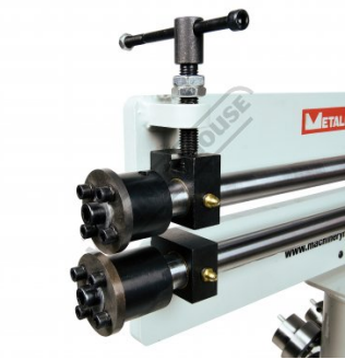
Shown With Shearing Dies