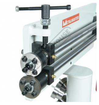
Top Roll Height Adjustment Handle