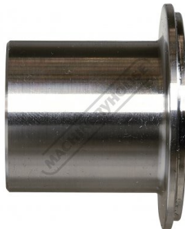
Outside Offset Die Side View (D)