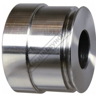
Lower Edge Forming Die (F)