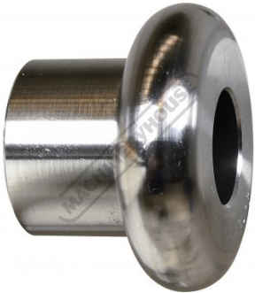
1/2 Inch Tipping Die (H)