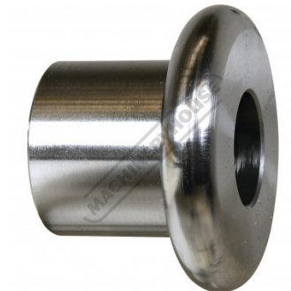
3/8 Inch Tipping Die (G)