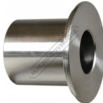
Inside Tipping Die (C)