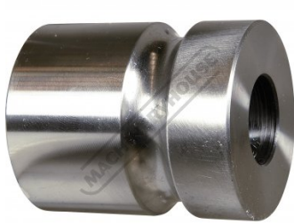
180 Degree Lower Die (B)