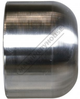
Round Tipping Die Side View (I)