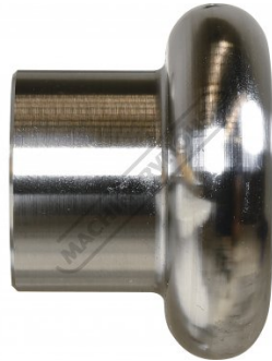
1/2 Inch Tipping Die Side View (H)