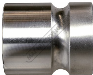
180 Degree Lower Die Side View (B)