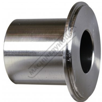
Outside Offset Die (D)