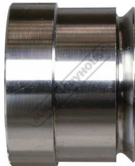
Lower Edge Forming Die Side View (F)