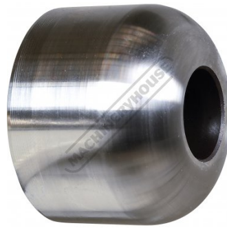
Round Tipping Die (I)