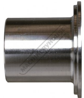
Inside Tipping Die Side View (C)