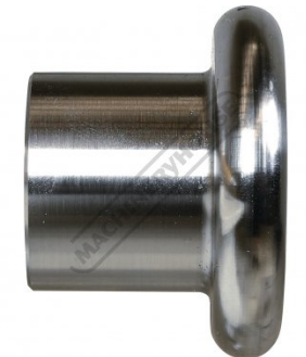
3/8 Inch Tipping Die Side View (G)