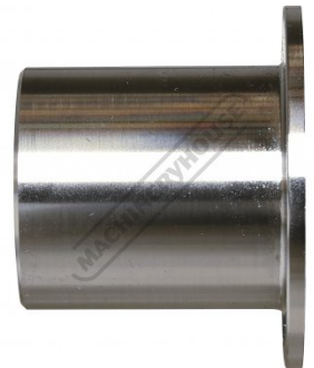
Knife Edge Tipping Die Side View (E)