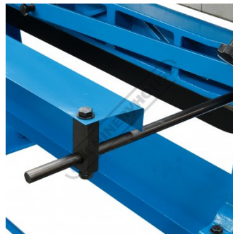
Adjustable Rear Stop