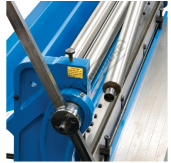
Drive Crank Handle