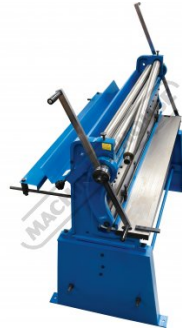
Swing Out Top Roller