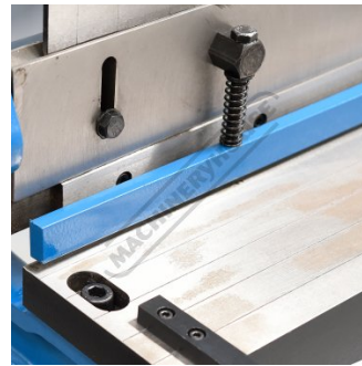
Material Clamp For Shearing