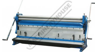
Curving Rolls Full View