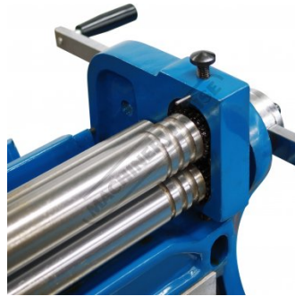
Wire Grooves Rolls