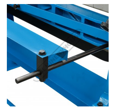
Adjustable Rear Stop