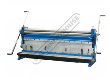
Curving Rolls Full View