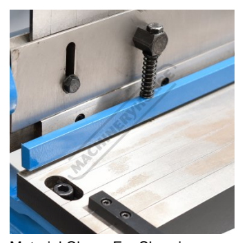
Material Clamp For Shearing