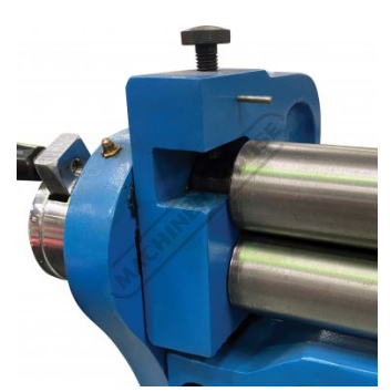
Solid End Housing & Top Roller Lock Wire Grooves Rolls