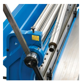
Drive Crank Handle