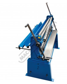
Swing Out Top Roller