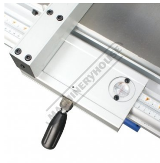
Rip Fence Closup