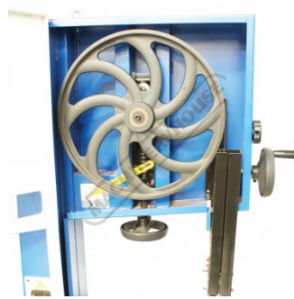
Heavy Duty Cast Iron Wheels