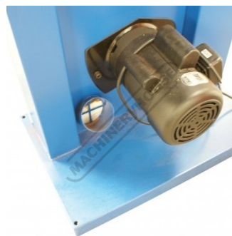
Rear Dust Chute