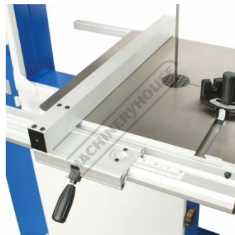
Sliding Rip Fence