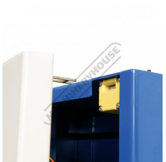
Safety Micro Switch on Doors