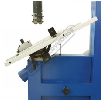
Cast Iron Table Tilts to 45 Degrees