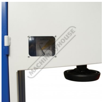
Blade Tension View Window