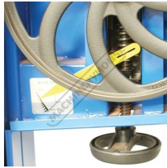
Blade Tension Sight Indicator