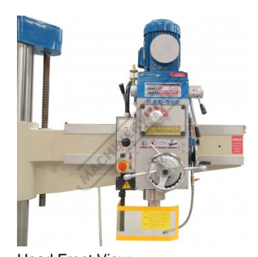
Head Front View