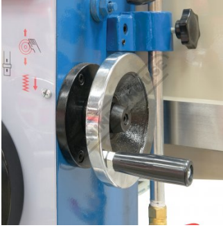
Micro Down Feed Hand Wheel