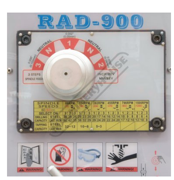
Auto Down Feed and Speed Chart