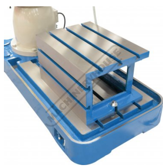
T Slott Base-Box Table