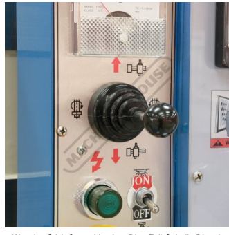
4 Way Joy Stick Control for Arm Rise-Fall-Spindle Direction