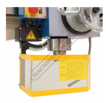
Safety Chuck Guard