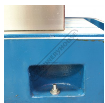
Foot Mounting Points