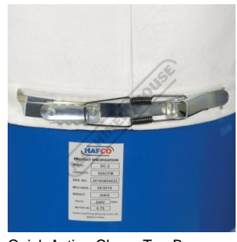
Quick Action Clamp Top Bag