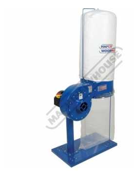
Left Rear View