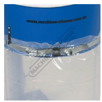
Quick Action Clamp Bottom Bag