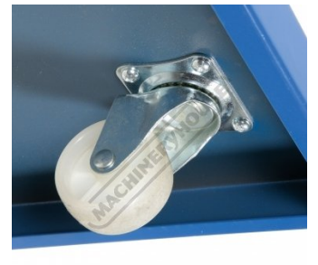
4 Swivel Wheels