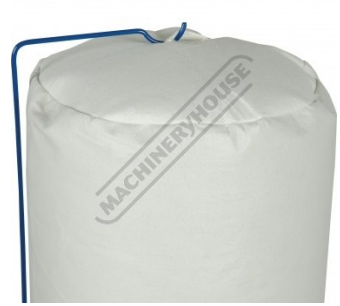
Top Bag Support Hook