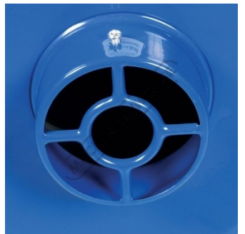
100mm Single Inlet