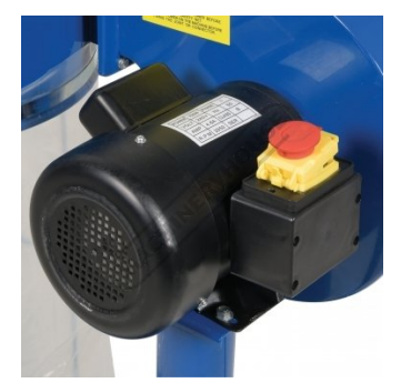
1hp 240V Motor