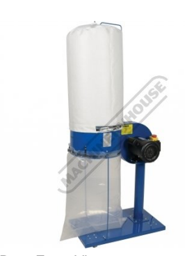
Rear Front View