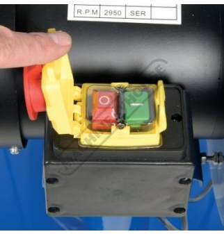
Magnetic Safety Switch