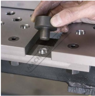
Use the Channel Block and Rest Button when a flat continuous support surface is required directly over the 40mm table slots