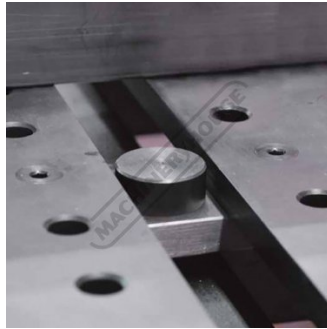
After mounting the Channel Block insert the Rest Button into the center hole of the Channel Block to create a continuous work surface