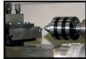
Correct Centre Height

For the tool to cut correctly it needs to be set on centre. This can be best achieved by placing a centre in the tailstock and adjusting the tool height to line up with centre point.