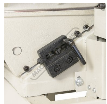
In-Feed Table Height Stop Setting