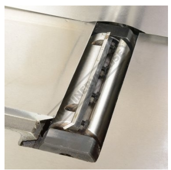
3 Blade Cutter Head

sales@machineryhouse.com.au www.machineryhouse.com.au