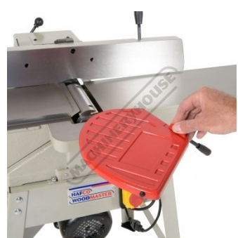
Spring Loaded Blade Guard