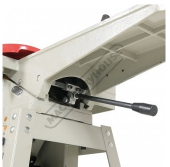
In-Feed Table Height Adjustment