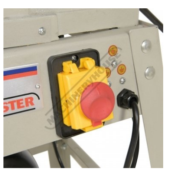
Safety DOL On/Off Switch