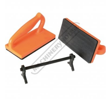
In-Feed Table Height Adjustment Scale Out-Feed Table Height Adjustment Dial Includes Blade Setting Gauge & Material Push Paddles