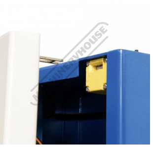
Safety Micro Switch on Doors