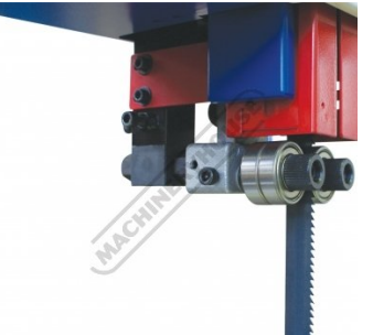
Bearing blade guides