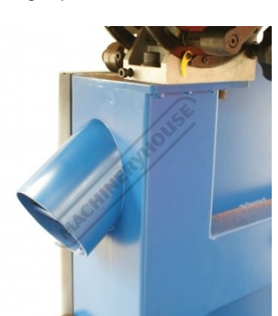
100mm Dust Chute