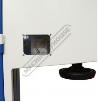
Blade Tension View Window