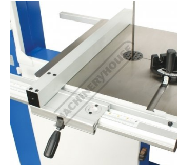
Sliding Rip Fence