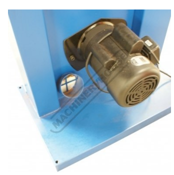
Rear Dust Chute