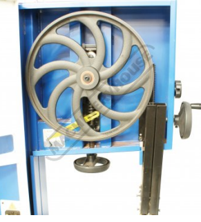
Heavy Duty Cast Iron Wheels