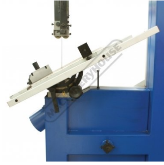
Cast Iron Table Tilts to 45 Degrees