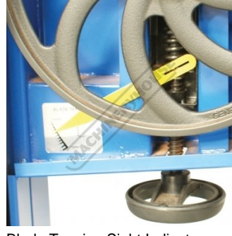
Blade Tension Sight Indicator