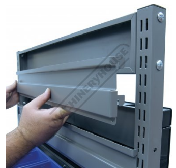
Optional Bracket Shown Clipping Onto Frame