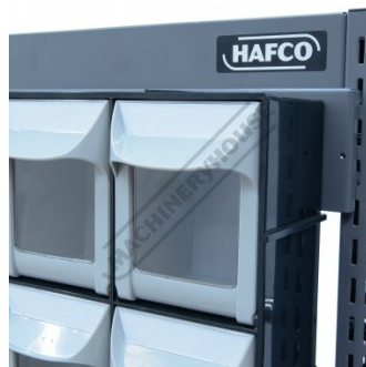
Medium Size Bins