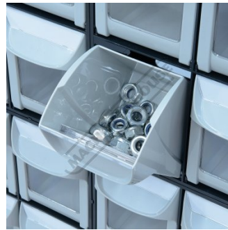
Bins Open Smoothly To a 40° Angle