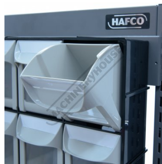
Bin Opened To 40° Angle