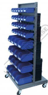
Shown with Optional Buckets A432, A434, A436