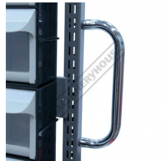
Chrome Handle Mounts on Left or Right Side