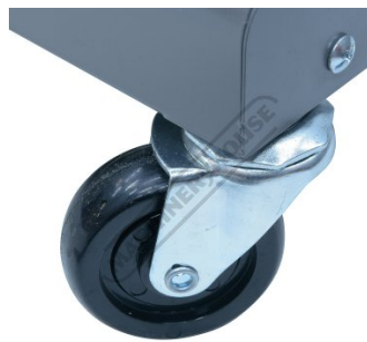
2 x Swivel Wheels