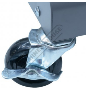
2 x Swivel Wheels with Brake