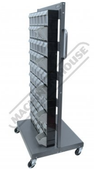
Right Side View Two Buckets Open