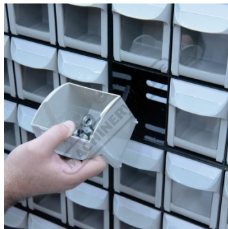
Removable Bins For Easy Access & Refilling