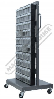
Right Side View Buckets Open