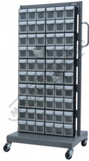
Few Buckets Shown Open