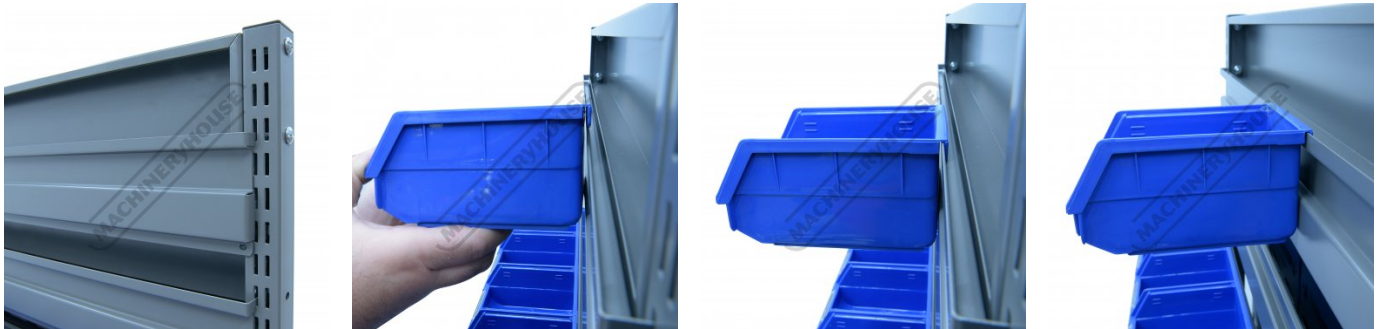
Optional Bracket Securely Clipped Onto Frame Optional Bucket Shown Clipped Onto Bracket Optional Bucket Shown Clipped Onto Bracket Optional Bucket Shown Clipped Onto Bracket