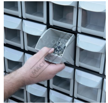
Removable Bins For Easy Access & Refilling