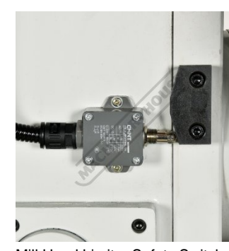
Mill Head Limiter Safety Switch