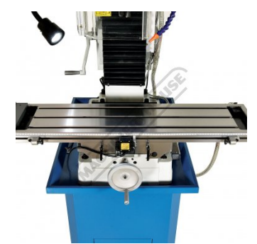
Large Ground Work Table with T Slots Table Limit Switches