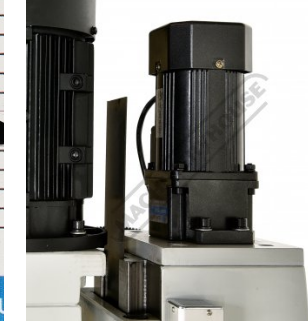
Motorized Z Axis