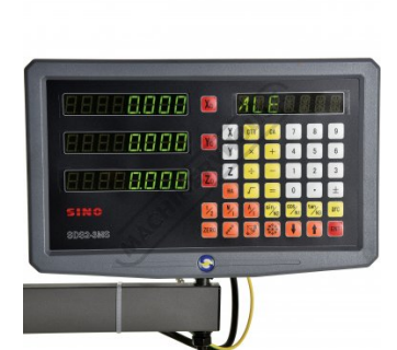
Digital Readout System