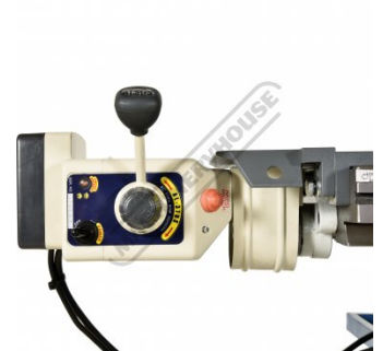
Power Feed Longitudinat X Axis