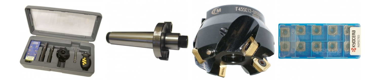
L065 KYOCERA Carbide Inserts -Milling