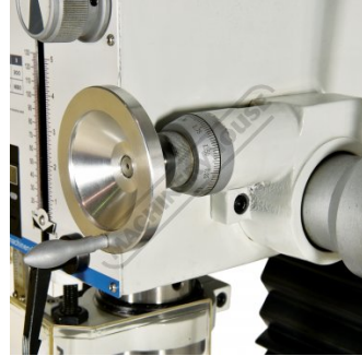
Fine Feed Handle