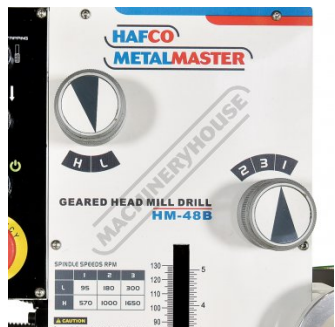
Spindle Speed Controls