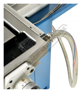
Table Coolant Return