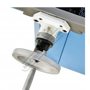
Table Feed Hand Wheel