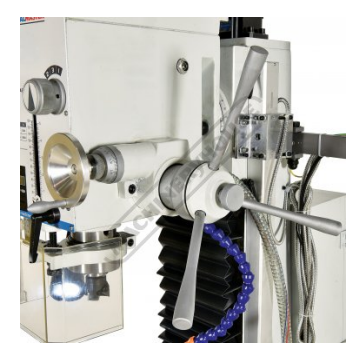
Quill Feed Handle