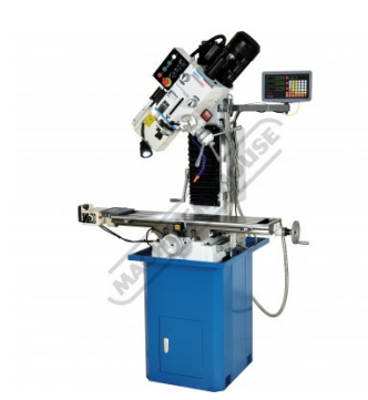
Swivel Head - 45 Degrees Left or Right 45 Degrees To Right