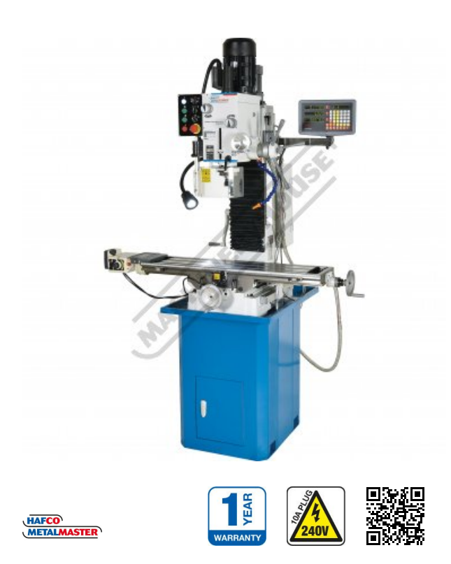
Table Travel: (X) - 670mm (Y) - 205mm (Z) - 380mm Includes Digital Readout System, Dovetail Column, Power Feed & Stand