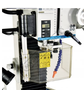
Swivel Safety Guard