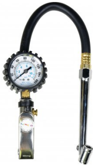
A259 Tyre Inflator with Dial Gauge