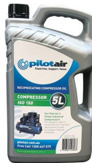
C346 ISO 150 Air Compressor Oil