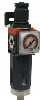
A220 Air Filter Regulator