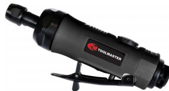
A040 Air Die Grinder