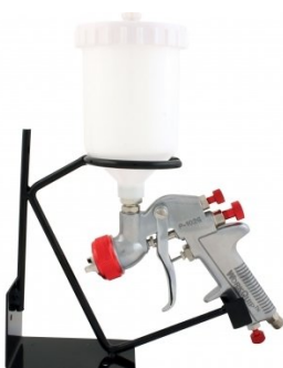
S326 Gravity Feed - Spray Gun