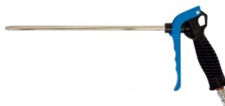
A251 Hi Flow Air Duster Gun