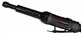
A041 Air Die Grinder - Extended Shaft 5" (127mm)