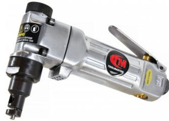
A082 Air Nibbler