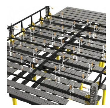
Shown with Optional Accessories and Joining Multipe Tables