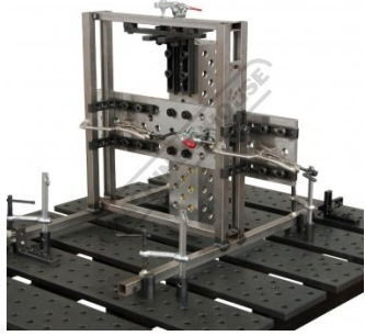
Shown with Optional Accessories Setting Up Frame 2 Shown with Optional Accessories Setting Up Frame 3 Shown with Optional Accessories Setting Up Frame 4 Shown with Optional Accessories Setting Up Frame 5