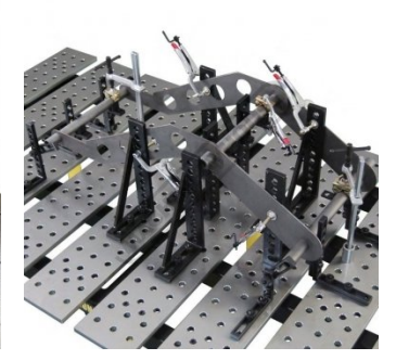
Shown Welding with Optional Accessories Setting Up Go Cart Frame Shown with Optional Accessories Setting Up Sheetsteel Shown with Optional Accessories Setting Up Frame