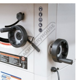
Blade Adjustment Handles