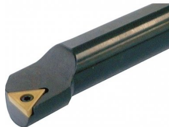
L022 Right Hand Boring Bar