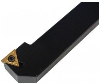
L018 Left Hand Turning Tool Holder