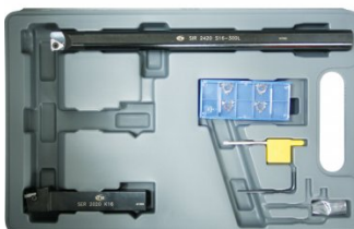
L458 Lathe Threading Tool Kit - Insert Type