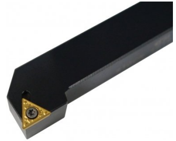
L017 Right Hand Turning Tool Holder