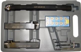
L453 Lathe Turning Tool Kit - 3 piece Insert Type