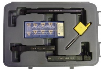
L450 Lathe Turning Tool Kit - 3 piece Insert Type