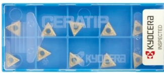
L062 KYOCERA Carbide Inserts - Turning