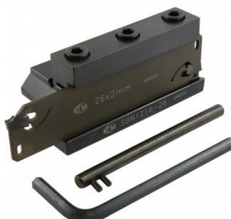
L464 Professional Lathe Parting Tool Kit - Insert Type