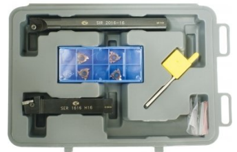
L457 Lathe Threading Tool Kit - Insert Type