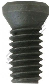
L525 Screw to Suit Turning Tool Holder