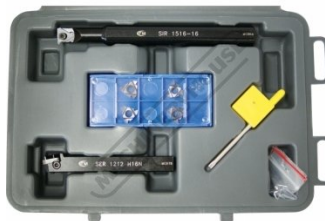
L456 Lathe Threading Tool Kit - Insert Type