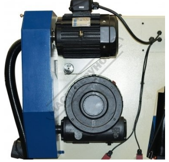
Industrial Motor and Gearbox Drive Controller