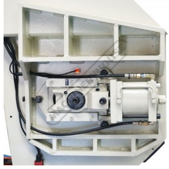
Hydraulic Blade Tension Device