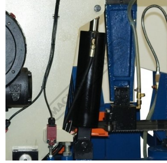
Hydraulic Rise And Fall