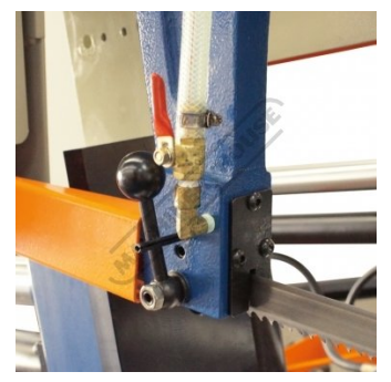
Ball Bearing Blade Guide with Coolant Coolant Hose