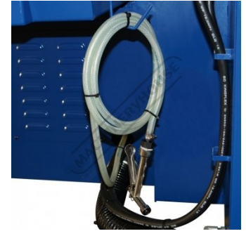
Wash Down Hose with Trigger Gun