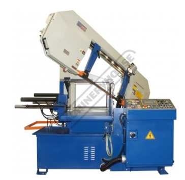
Swivel Head 45 Degrees