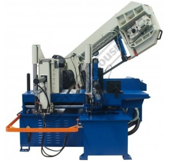
Side View 45 Degrees Swivel Head Hydraulic Hitch Feed With Bundle Cutting Clamps