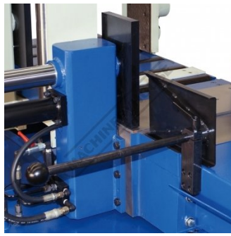
Adjustable Material Guide