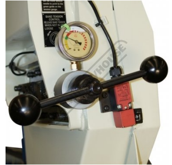
Blade Tension Gauge