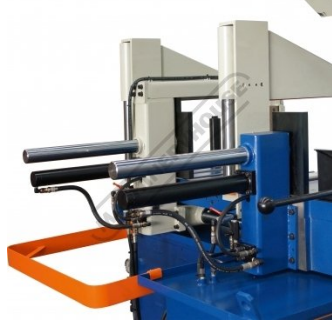
Full Stroke Hydraulic Vice Clamps