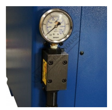
Adjustable Vice Pressure Regulator Hydraulic Retracting Rear Vice Jaw Hydraulic Rise-Fall with Spring Damperer Hydraulic Swarf Conveyor

sales@machineryhouse.com.au www.machineryhouse.com.au