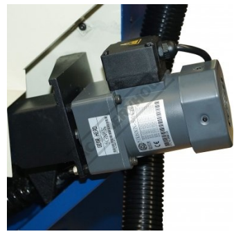
Powered Blade Cleaning Brush