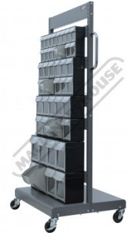
Right Side View Few Buckets Open