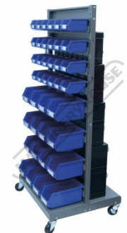
Shown with Optional Buckets A432, A434, A436