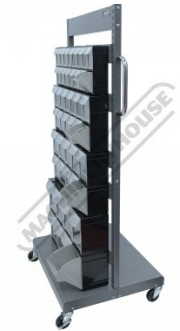
Right Side Top View Buckets Open