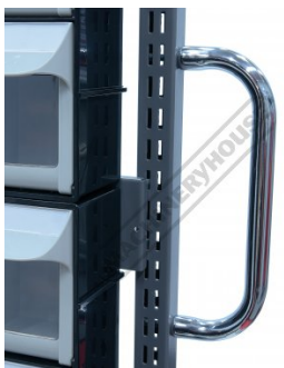
Chrome Handle Mounts on Left or Right Side