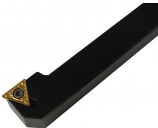
L016 Left Hand Turning Tool Holder