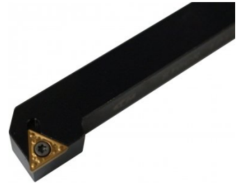
L015 Right Hand Turning Tool Holder