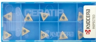
L062 KYOCERA Carbide Inserts - Turning