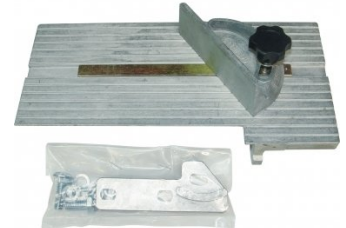
L086 Multitool Tilting Table & Mitre Guide