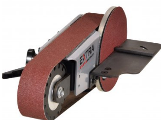
L0912 Industrial Belt & Disc Linishing Attachment