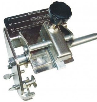
L083 Multitool Chisel Sharpening Jig