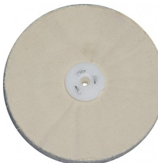
G186A Buffing Mop