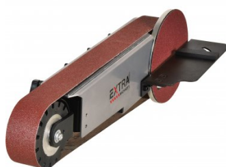
L085 Multitool Belt & Disc Linishing Attachment