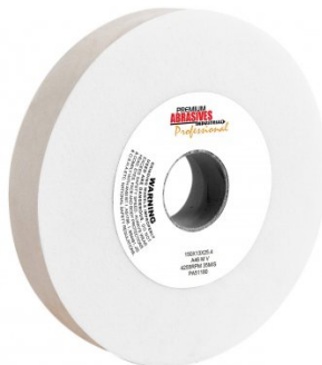
G171 White - Alox Grinder Wheel