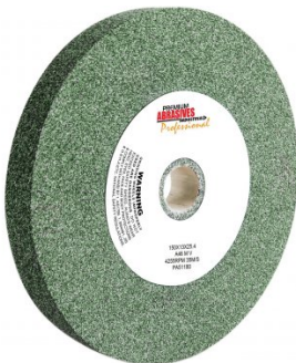
G170 Silicon Carbide Grinder Wheel