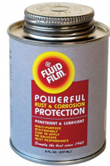
O043 Rust & Corrosion Preventive - Penetrant & Lubrication