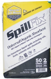
O000 SpillFix Universal Organic Absorbent