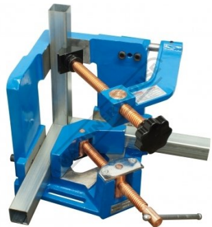
Shown With Box Tubing And Small Vee Clamp