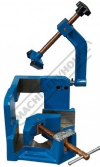
Show with Top Clamp Swiveled Away