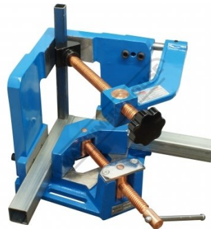
Shown With Small Box Tubing And Small Vee Clamp