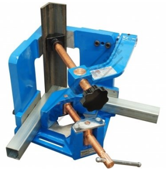
Shown With Box Tubing And Angle Iron