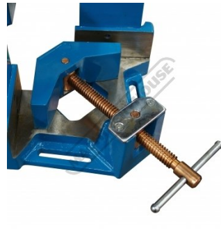
Copper Leadscrew For Welding Applications