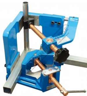
Shown With Box And Round Tubing