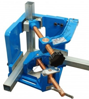
Shown With Box Tubing