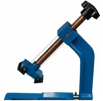
Swivel Away Top Clamp