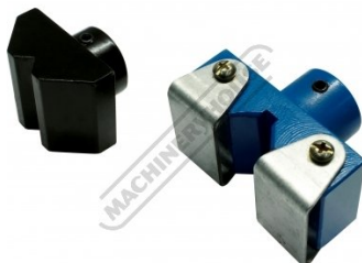
1x small And 1x large Clamp Attachments