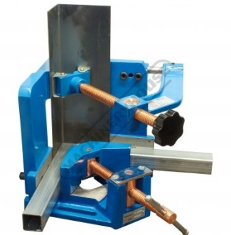
Shown With Tubing And Large Angle