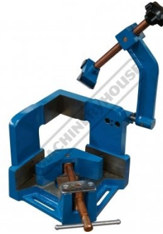
Front View Show with Top Clamp Swiveled Away