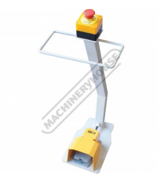
Mobile Foot Control