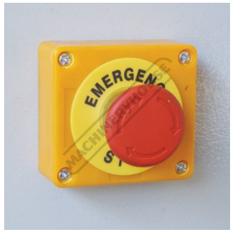
Emergency Stop Switch