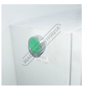
Rear Guard Reset Button