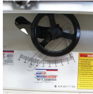
Tilting Arbor Gauge to 45 degrees and Blade Height Adjustment Hand Wheel and Lock