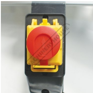
Magnetic Safety Switch