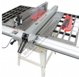
Heavy Duty Rip Fence with Micro Adjustment