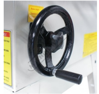
Tilting Arbor Hand Wheel and Lock