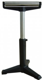
W3434 Roller Stand