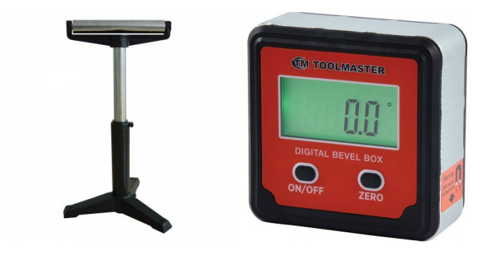
M977 Digital Bevel Box