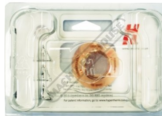
Packaging Rear View