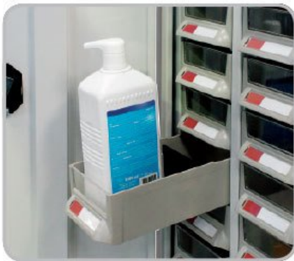
Safety Lip design