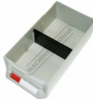
Parts Bin Top View