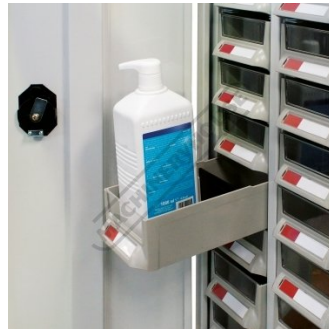
10kg Load With Safety Lip Design