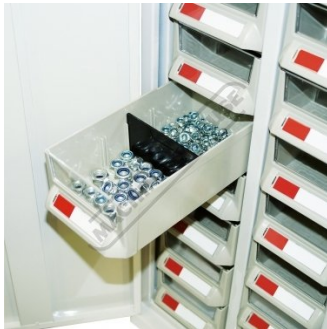
Drawer with Divider Shown with Parts

sales@machineryhouse.com.au www.machineryhouse.com.au