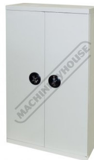
Cabinet Shown Locked