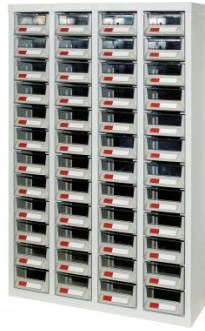
T7956 Parts Storage Bins