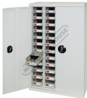
Door Open with Drawer Out