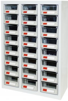
T7955 Parts Storage Bins