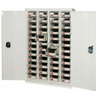
Cabinet Parts Bin Doors Open