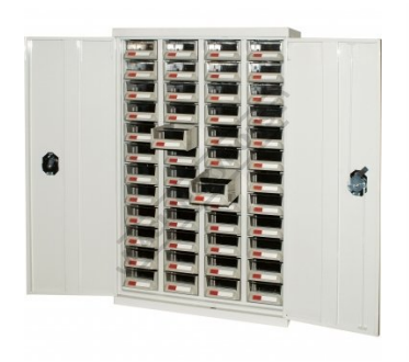
Cabinet Parts Bin Doors Open