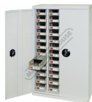
Door Open with Drawer Out