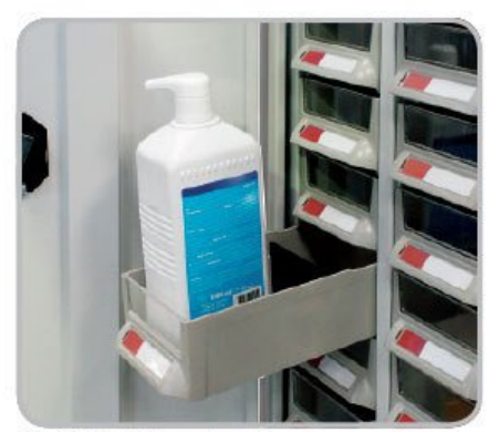
Safety Lip design