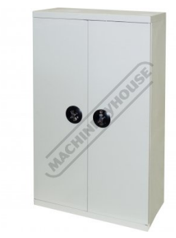
Cabinet Shown Locked