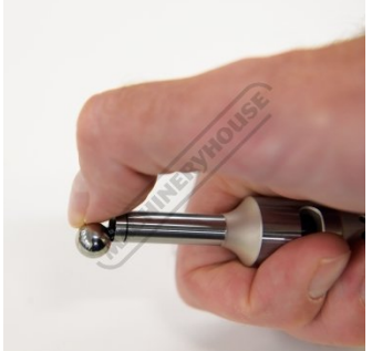
Spring Loaded Ø10mm Ball Shown