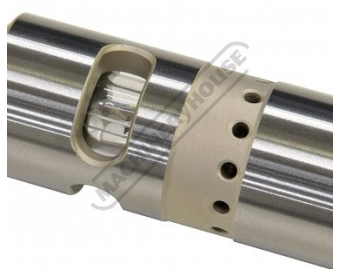
Red Light Illuminates & Audio Beep Sound Alerts for Deeper Holes Spring Loaded Ø10mm Ball