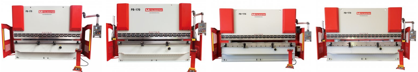
S910GL Hydraulic NC Pressbrake