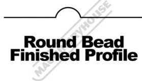
Round Bead Finished Profile