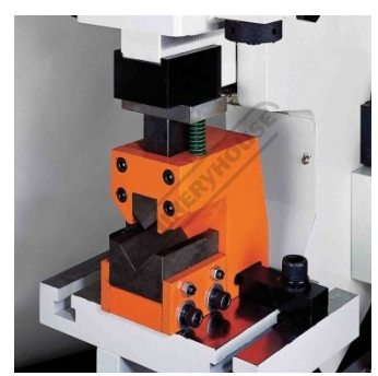
Optional Angle Bending Press