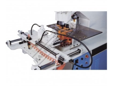
Optional Duplicating Table