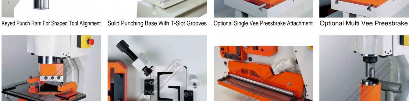
Optional Channel Shear