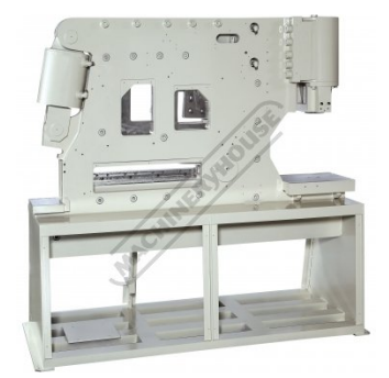
Monoblock Design For Rigid Frame Structure