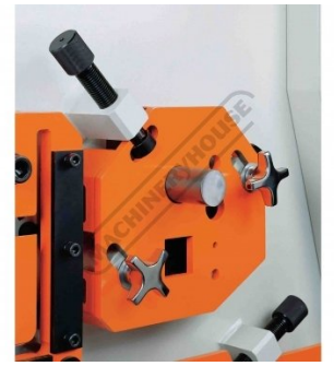
Round Bar Shear

sales@machineryhouse.com.au www.machineryhouse.com.au