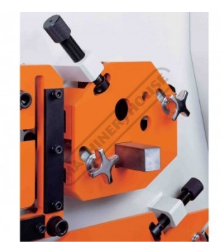
Square Bar Shear