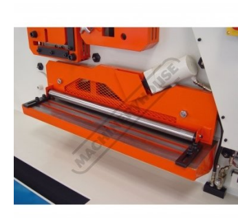
Optional Hydraulic Holddown for Flat Shear Optional Pipe Notcher