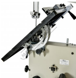
Tilt Table Adjustment