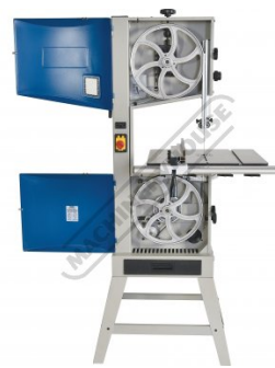
Easy Access for Blade Change