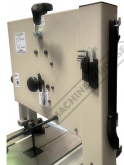
Push Stick and Tools