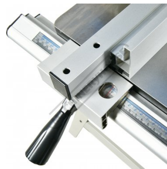
Fence with Quick Action Lock and Sight Glass