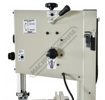
Blade Tension and Tracking Adjustments