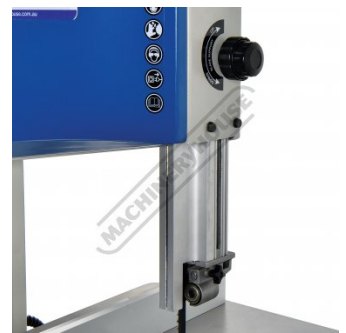
Blade Support Adjustment