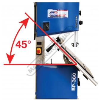
Cast Iron Tilt Table to 45 Degrees