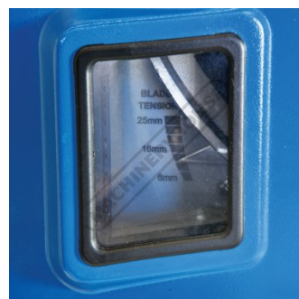
Blade Tension Scale