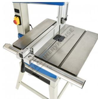
Sliding Rip Fence with High and Low Height Extrusion