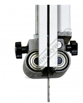
Ball Bearing Blade Guides