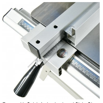
Sliding Rip Fence with High and Low Hieight Extrusion Fence with Quick Action Lock and Sight Glass Blade Support Adjustment