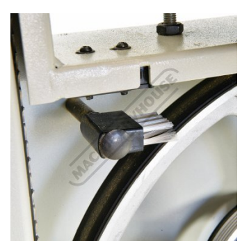
Wheel Cleaning Brush