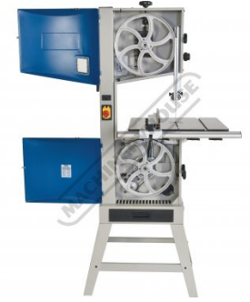
Easy Access for Blade Change