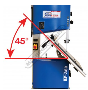
Cast Iron Tilt Table to 45 Degrees