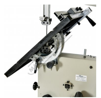
Tilt Table Adjustment