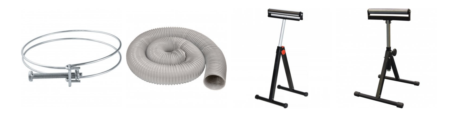
W3434 Roller Stand