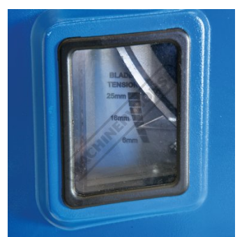
Blade Tension Scale