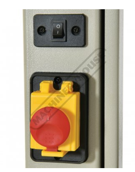
Safety Magnetic Switch and Light Switch Blade Speed Adjustment

sales@machineryhouse.com.au www.machineryhouse.com.au