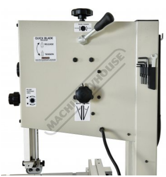
Blade Tension and Tracking Adjustments