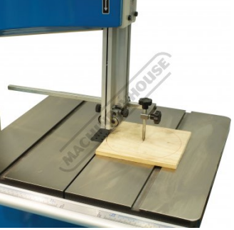
Shown with Optional Circle Cutting Attachment Minimum Floor Space Required