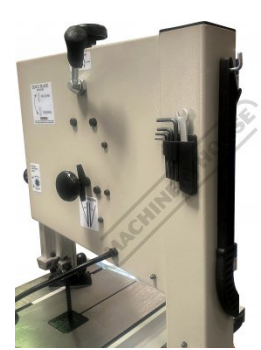
Push Stick and Tools