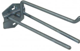
A444 Plier Holder - Triple Prong