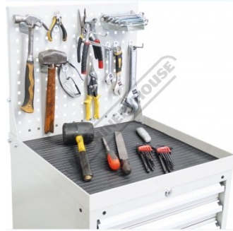
Shown with Optional Tools Left View