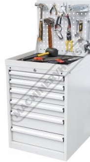
Shown with Optional Tools and Cabinet