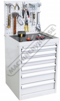
Shown with Optional Tools and Cabinet Left View