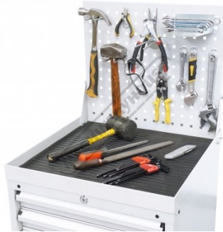
Shown with Optional Tools