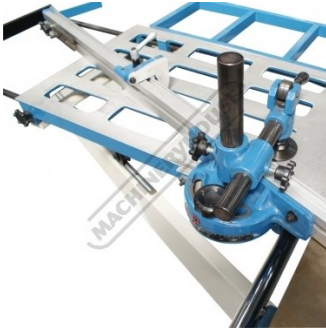
Sliding Table with Mitre Guide and Material Clamp