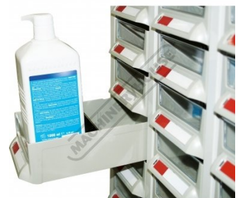
10kg Load With Safety Lip Design