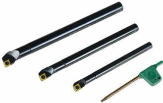
L430 Boring Bar Set - Carbide Insert